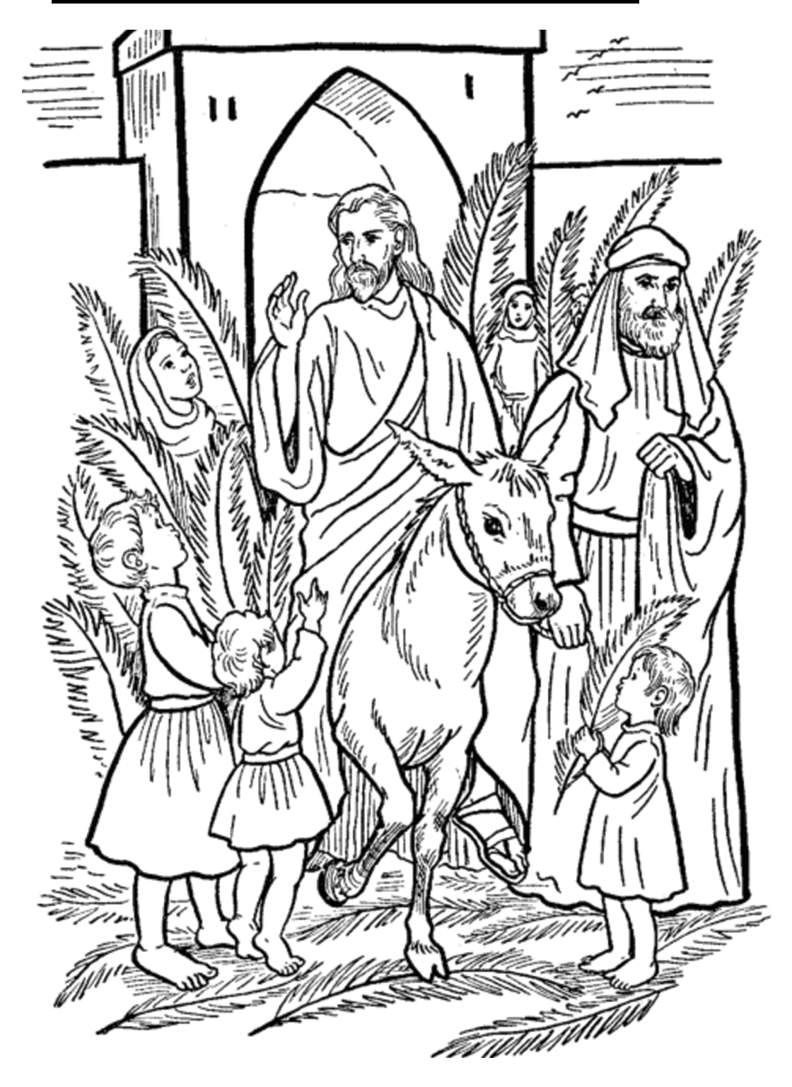
"Hosanna in the highest!" Mark 11:10