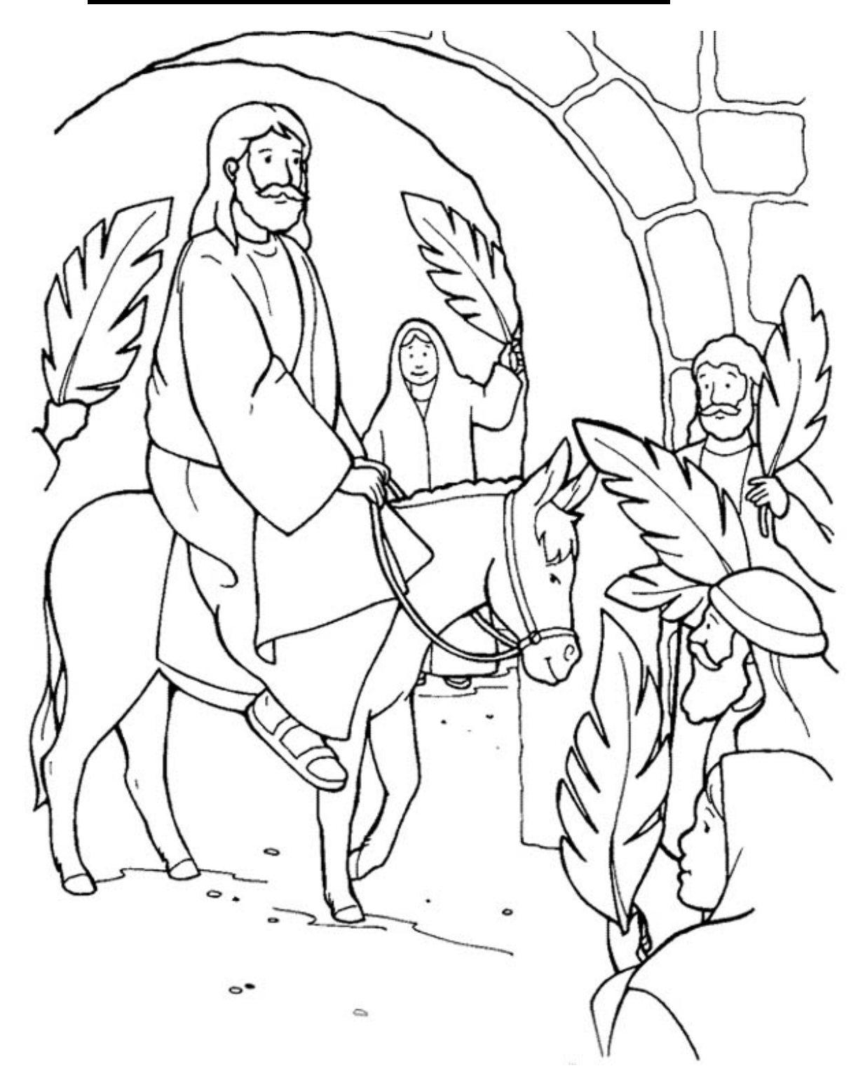
Pre-K - Week 6 - Jesus Enters Jerusalem