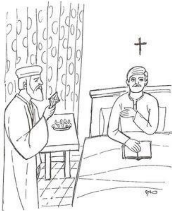
The priest stands toward the east. The patient sits with all respect and priest start to lighten the first candle and prays