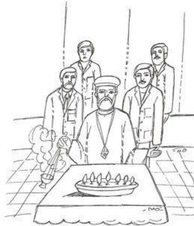
The church put certain prayers for the unction of the sick sacrament. The priest prays the litanies and there are seven of them